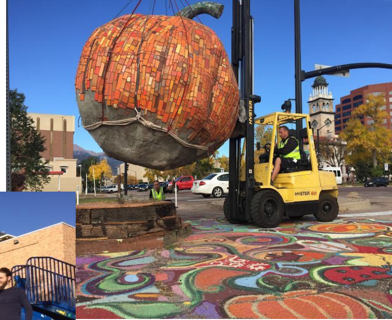
[Right: The construction of "The Great Pumpkin" located Downtown.]