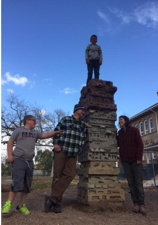
[Left: Before and after pictures of the climbing tower at Helen Hunt Campus]