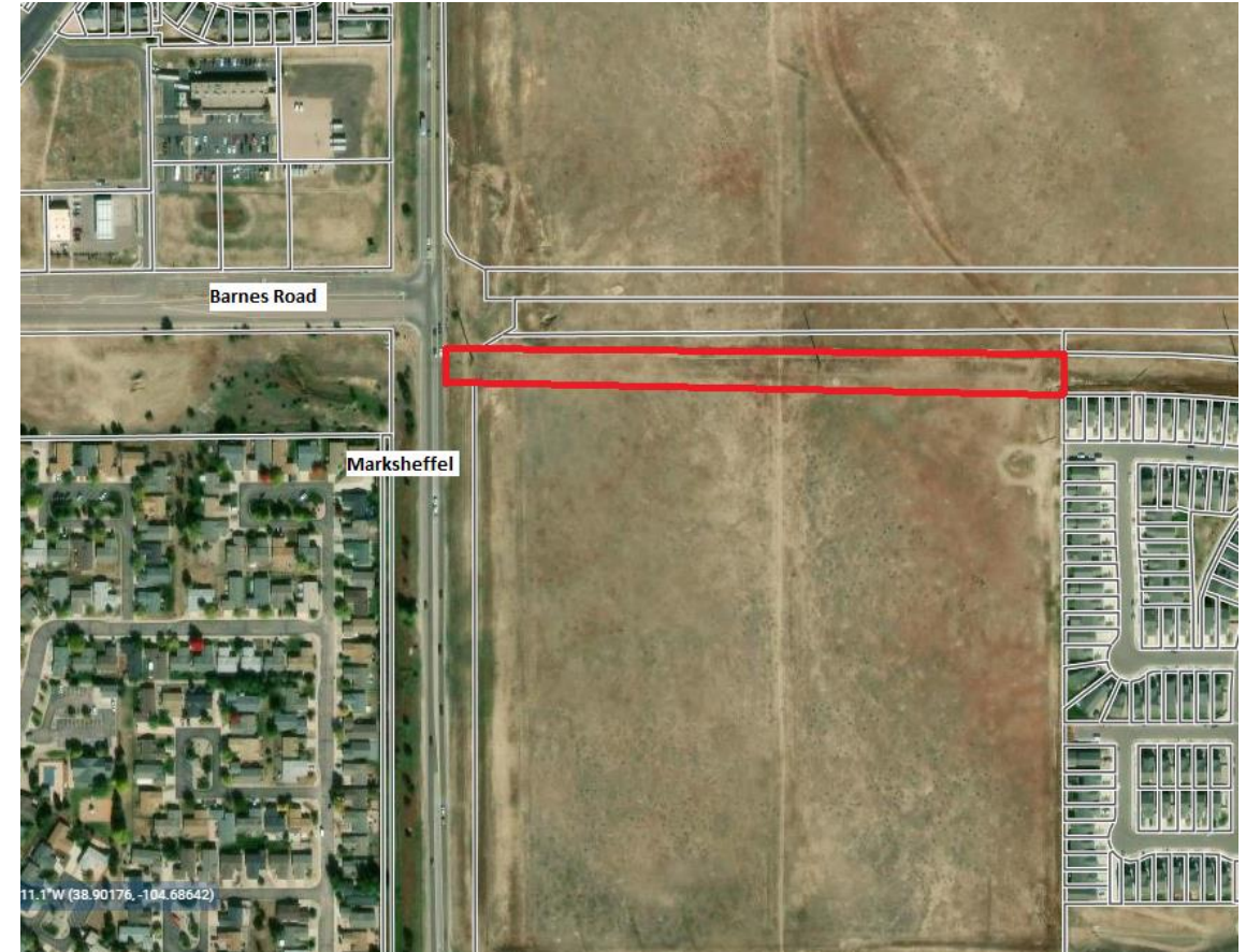
Marksheffel Rd. and Barnes Rd.