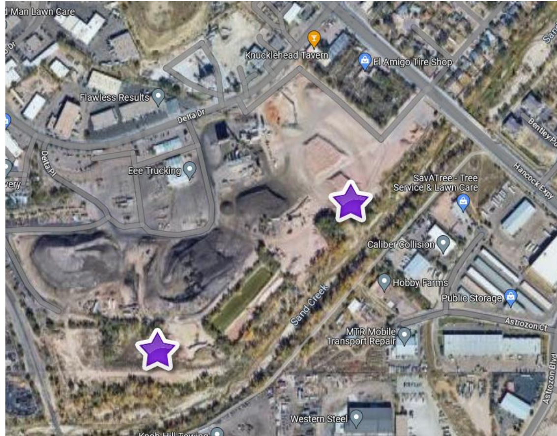
Hancock Expressway and Delta Dr.