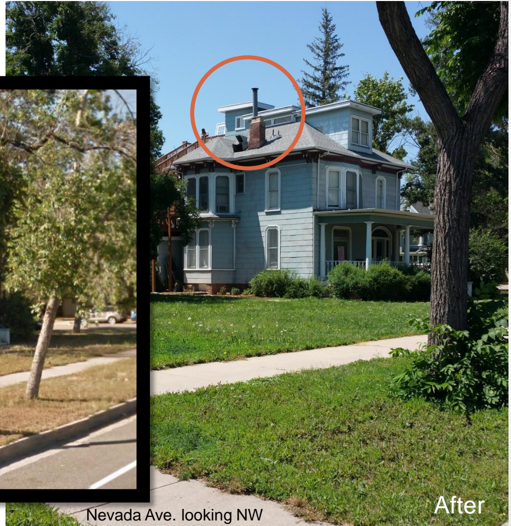
Nevada Ave. looking NW