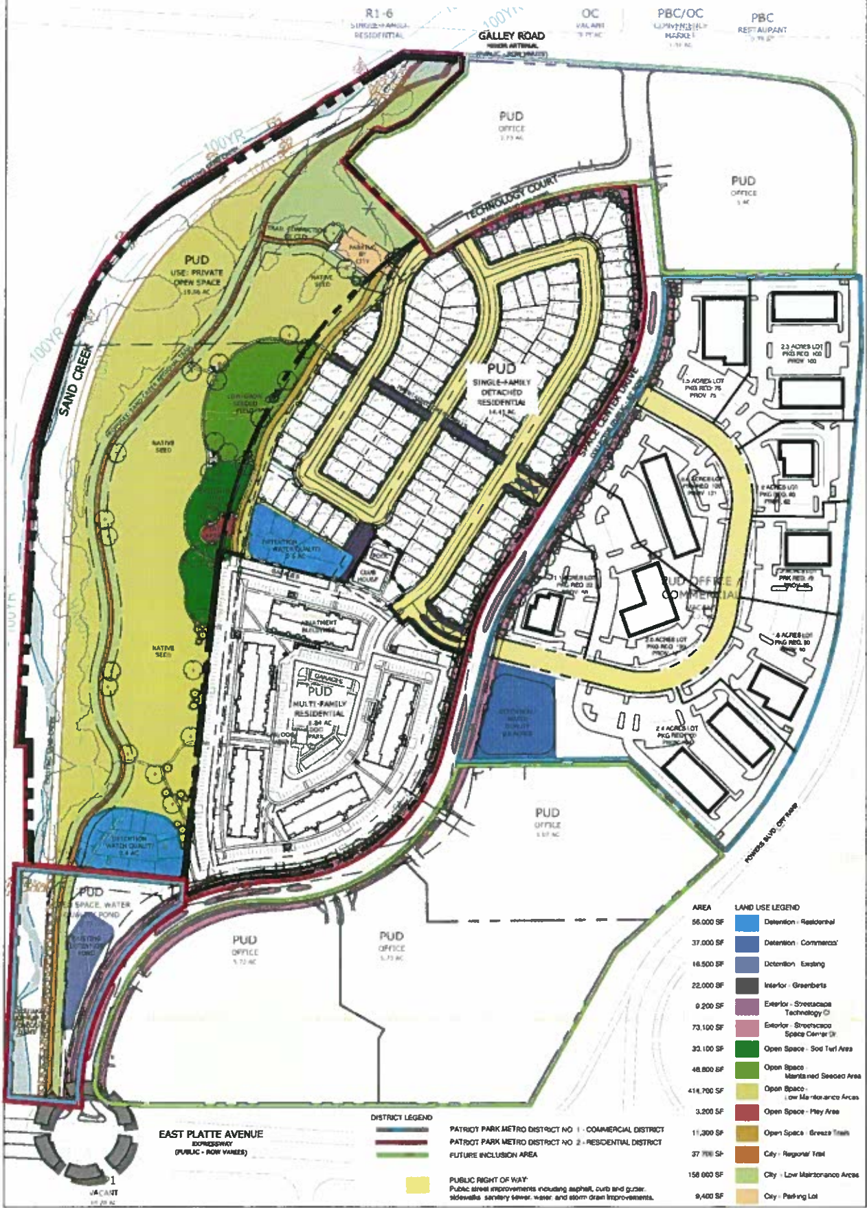
EXHIBIT D PATRIOT PARK METROPOLITAN DISTRICTS NO. 1 AND NO. 2 DISTRICT FACILITIES AND IMPROVEMENTS MAP