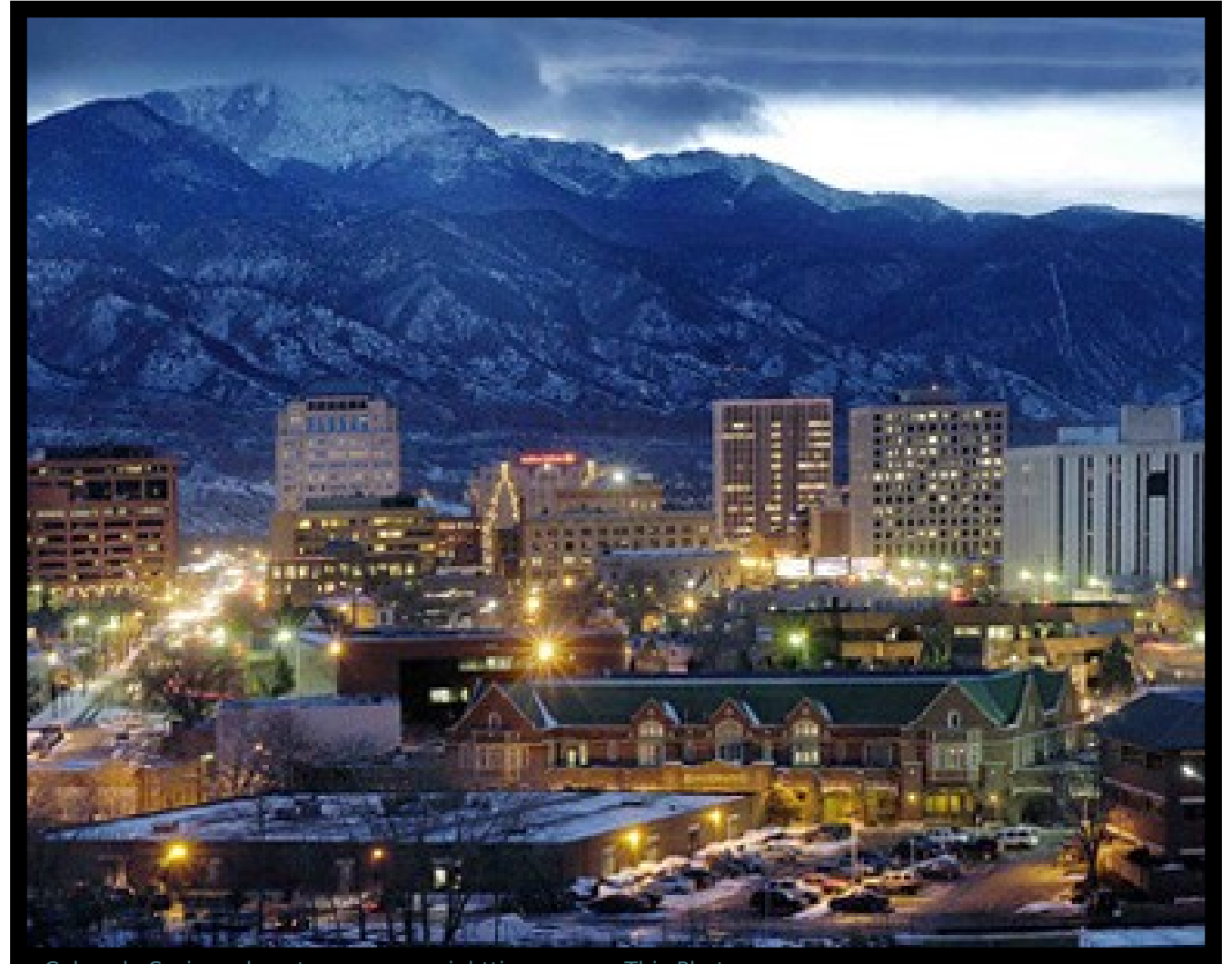
Colorado Springs downtown snowy nighttime scene.