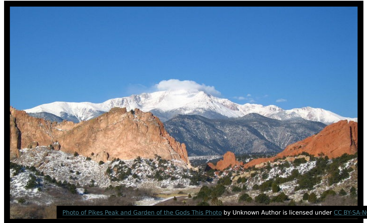
Photo of Pikes Peak and Garden of the Gods

Call 719-385-2387 to make an anonymous report of suspected fraud, waste, or abuse related to the City of Colorado Springs or report online Fraud Reporting Form