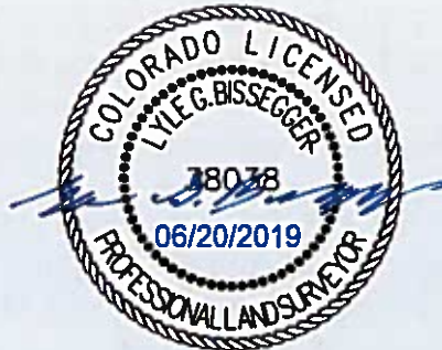
EXHIBIT B is attached hereto and is only intended to depict EXHIBIT A – Legal Description. In the event that EXHIBIT A contains an ambiguity, EXHIBIT B may be used to resolve said ambiguity.

Prepared for and on behalf of Galloway by Lyle G. Bissegger, PLS# 38038