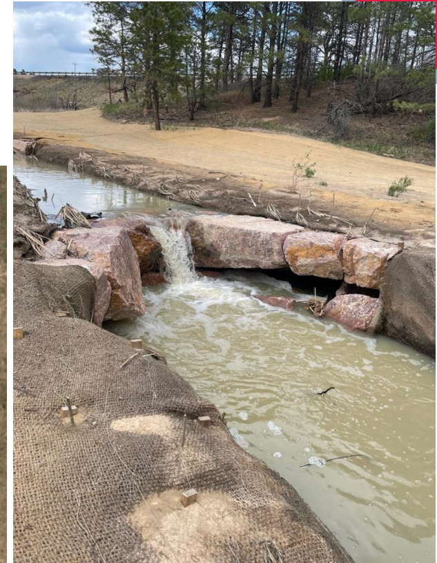
Black Squirrel Creek