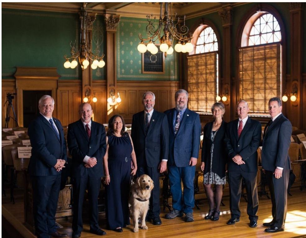
The newly sworn-in City Council following the Swearing-In Ceremony on April 20, 2021

2021 brought City Council another challenging year full of change and new opportunities. This year City Council welcomed four new Councilmembers and said farewell to a couple of treasured colleagues and friends. The transition to a permanent hybrid model for City Council meetings highlighted the need for technology upgrades to Council Chambers in City Hall. For six months City Council held meetings in the Colorado Springs Utilities' Blue River Boardroom at the Plaza of the Rockies while construction was underway. In addition to technology upgrades, City Council also continued to tackle the ongoing issue of affordable and accessible housing. The City Council also considered several legislative issues including carports, wildfire evacuation, and humane pet stores. In the last year, City Council passed over 295 ordinances and resolutions, grew valuable relationships with community organizations, and propelled the City Strategic Plan forward.