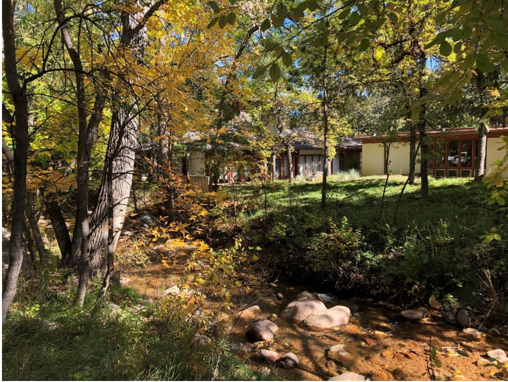
Planned site for the Golden Lotus Asian Heritage Center at Stratton Park