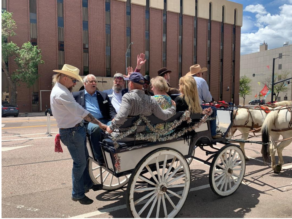
Councilmembers and Mayor Suthers enjoy a carriage ride following the token presentation for the Western Street Breakfast