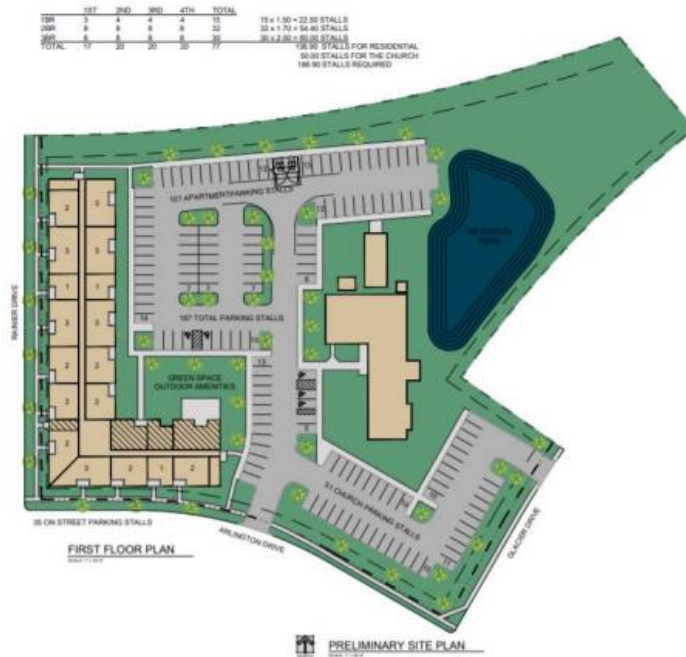
Village at Solid Rock Preliminary Site Plan