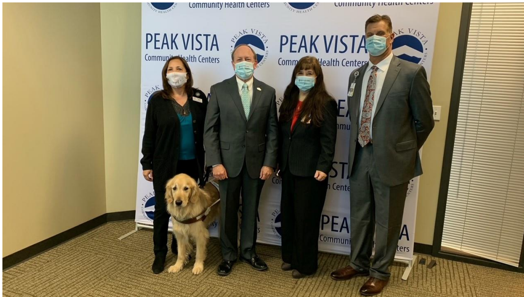
Councilmember Avila and Mayor Suthers at a Peak Vista Community Health Centers COVID-19 Vaccination site.