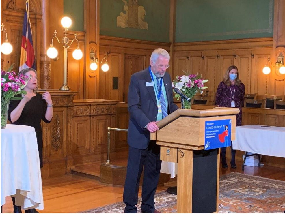
Council President Strand gives remarks during a press conference honoring frontline workers of the COVID-19 pandemic