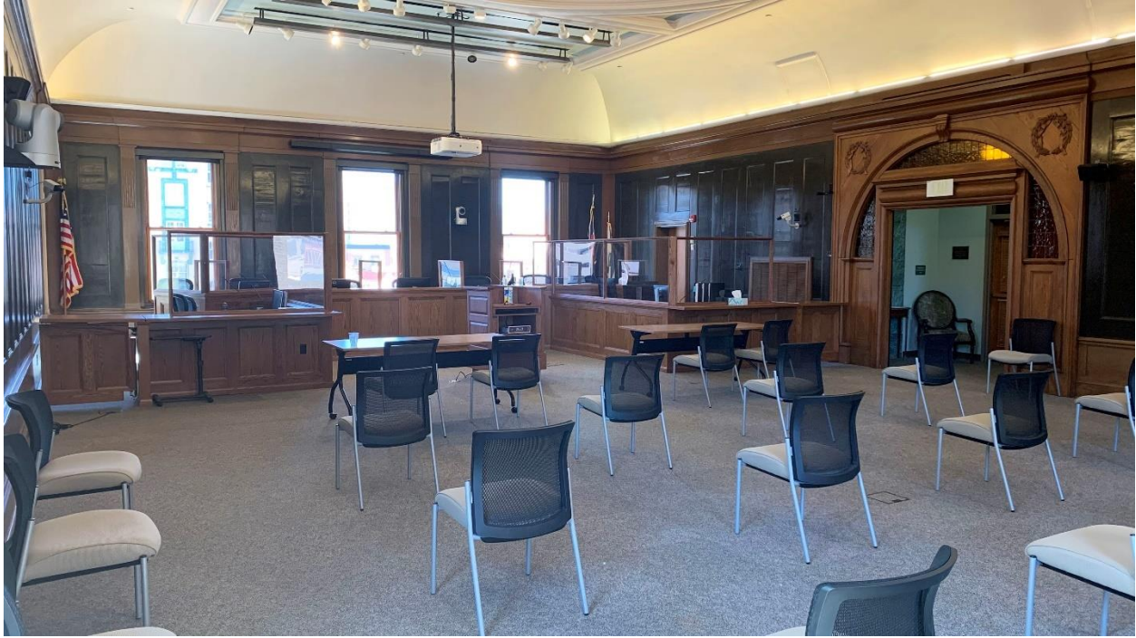
Council Chambers before the renovation

(MORE CHAMBERS RENOVATION PICS ARE AVAILABLE FOR USE IF YOU WOULD LIKE.)