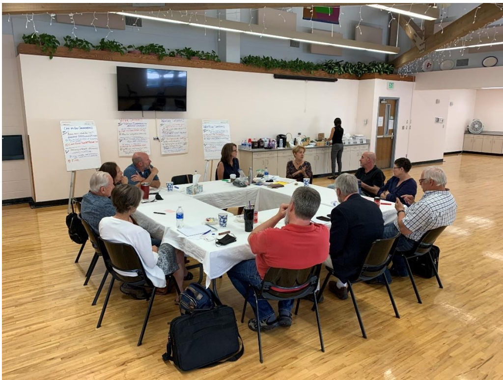
City Council retreat at Hillside Community Center

“In June, Councilmembers met at the Hillside Community Center for a retreat during which we learned more about each other as people and what we care about as we strive to serve our City. Many of the policies, regulations, and ordinances we debate and enact have important implications for the kind of growth we see in our region. I left the retreat feeling encouraged: While of course we don't all share the same views, if Councilmembers are going to form an effective team that serves everyone, we must listen respectfully, find common ground, and understand why we diverge when we do. I believe there's widespread recognition that the issue of responsible growth will color virtually everything City Council will do over the next number of years. And we don't have many chances to get it right. Let's keep talking, listening, and learning!”