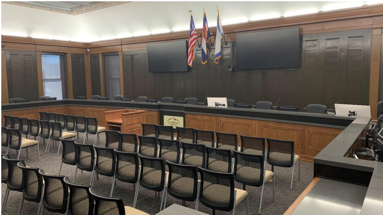
Council Chambers after the renovation

(MORE CHAMBERS RENOVATION PICS ARE AVAILABLE FOR USE IF YOU WOULD LIKE.)