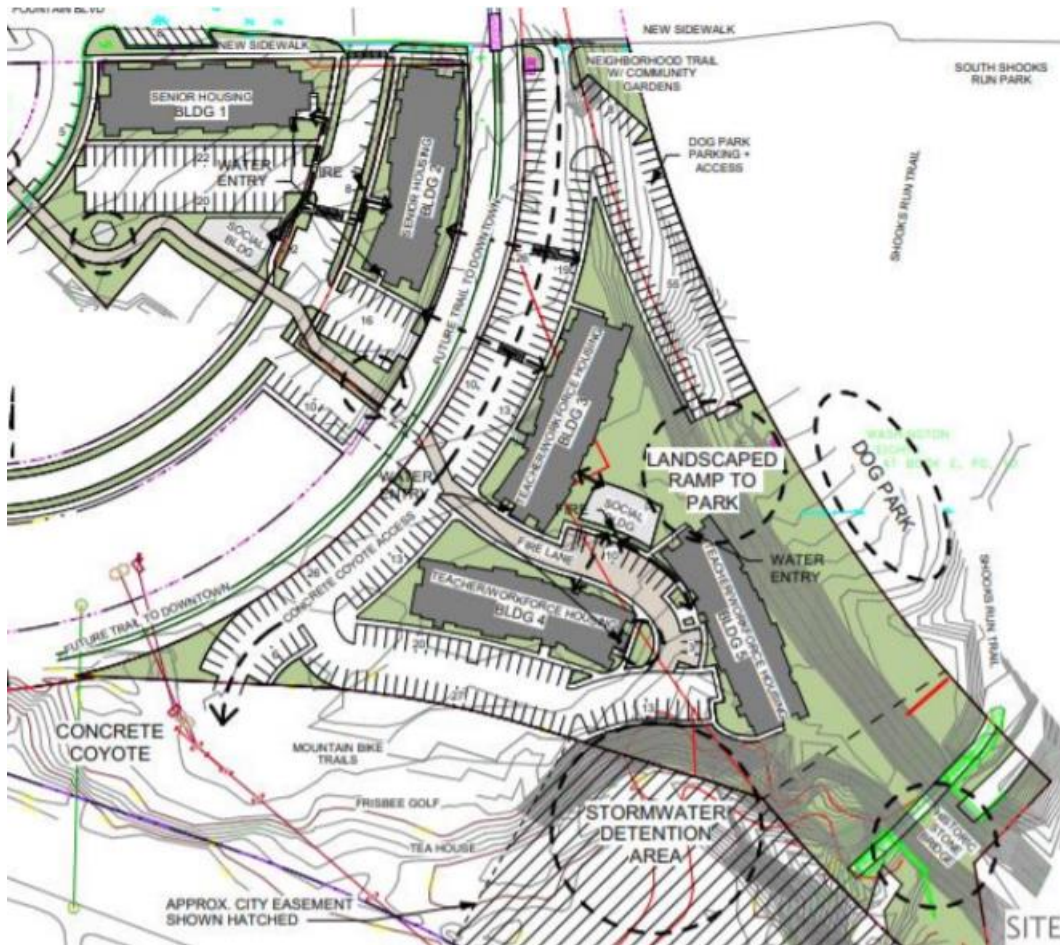
Draper Commons proposed design plan