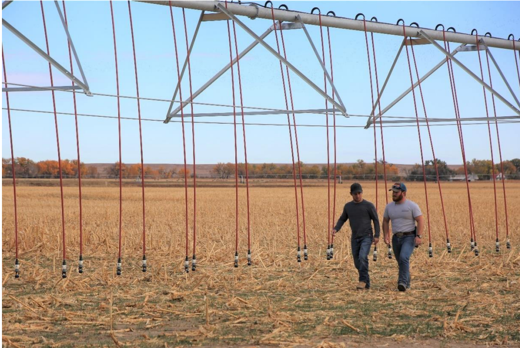
Colorado Springs Utilities is developing win-win solutions for sharing water with southern Colorado farmers, like Mark and Caleb Wertz.