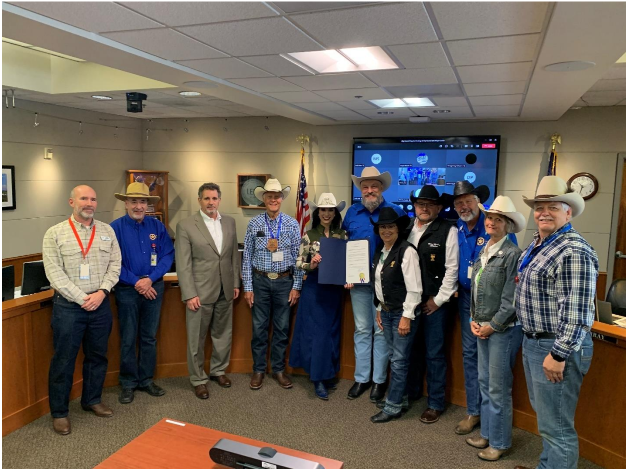
City Council wears Western clothing during a June meeting in support of the Pikes Peak or Bust Rodeo.