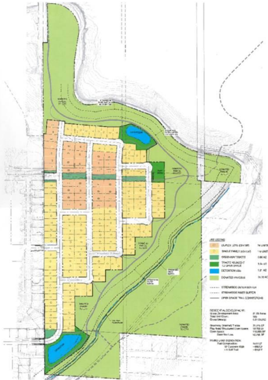
PIKES PEAK AVE. AT SAND CREEK SITE DEVELOPMENT LAYOUT GRAPHIC 06-07-2018