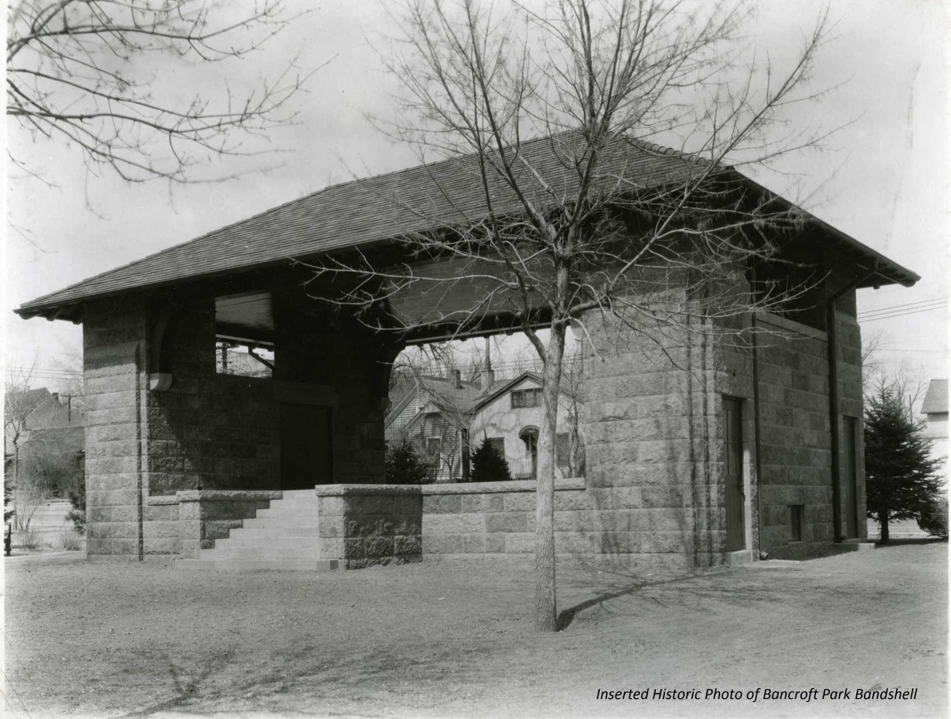
Inserted Historic Photo of Bancroft Park Bandshell