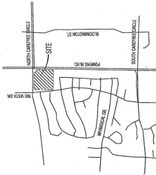
VICINITY MAP 1/8" SCALE