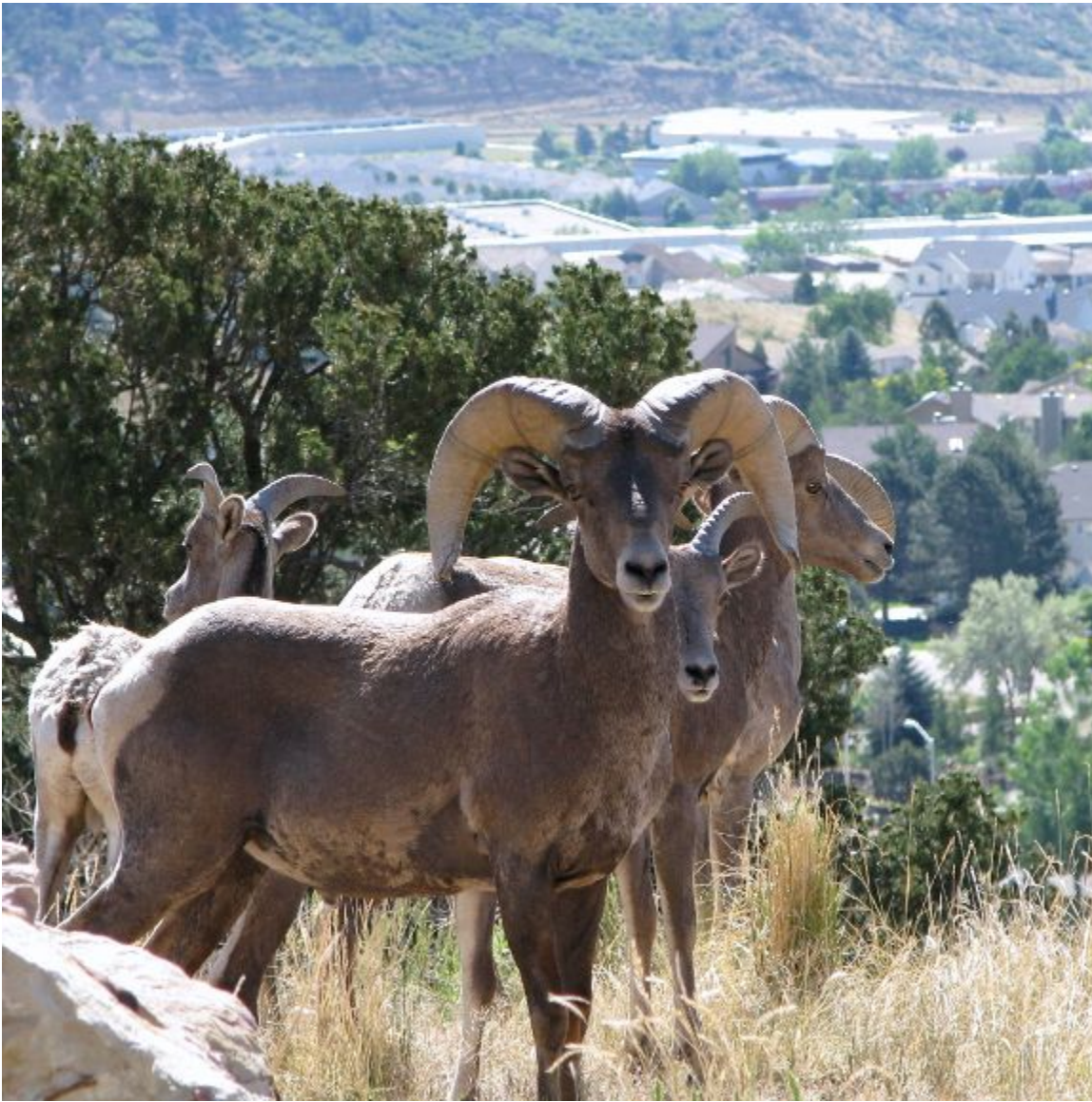
17. This final photo, taken at Chipeta School, looks towards 2424 GOTGR, Glenn Eyrie and the Garden of the Gods park. It shows the continuity of the wildlife migration corridor as well as the majestic landscape that the Hillside Overlay demands preservation of.