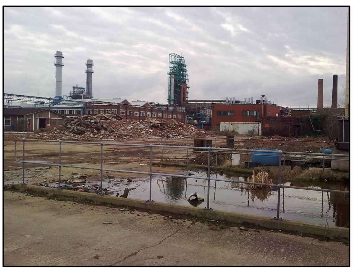
Industrial Brownfields Site

Legislatively authorized state program designed to facilitate cleanup and redevelopment of contaminated properties not subject to regulatory authority.