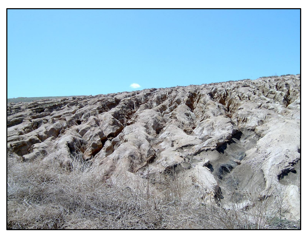
Eroding tailings at Gold Hill Mesa prior to cleanup

Current development process of the 210 acres site began in ~1995.