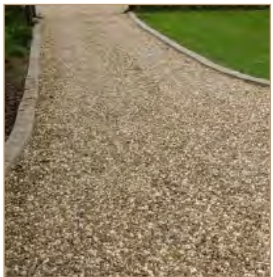
GRAVEL DRIVEWAY w/ concrete edging