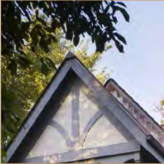
DECORATIVE TIMBER ACCENTS