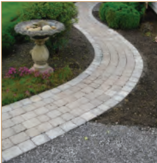
GRAY TONE PAVER WALKWAY