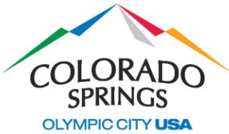
Cemetery Enterprise 2013-2024