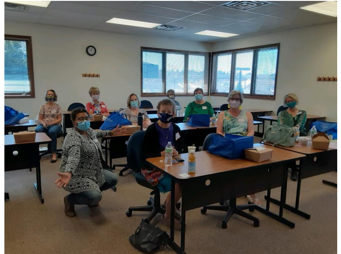
2021 Caregiver Pampering Day attendees at Newman University

Pandemic Support/Funding Senior Affordable Housing Mobility Coordination