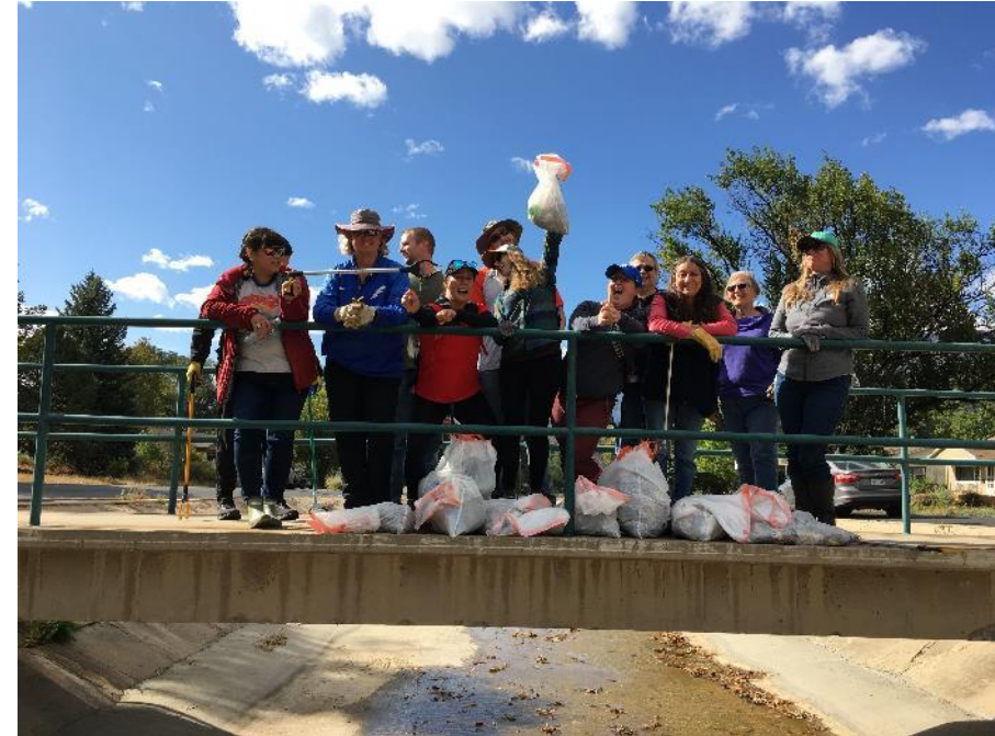
2019 Creek Week Clean up crew from PPACG

Conduct outreach, education and awareness around water quality issues, and begin watershed planning research