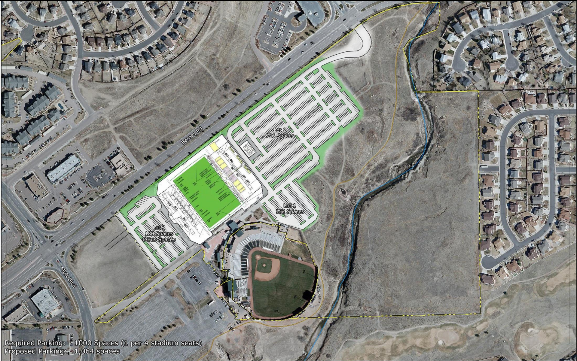
Coleman Park Parking Study