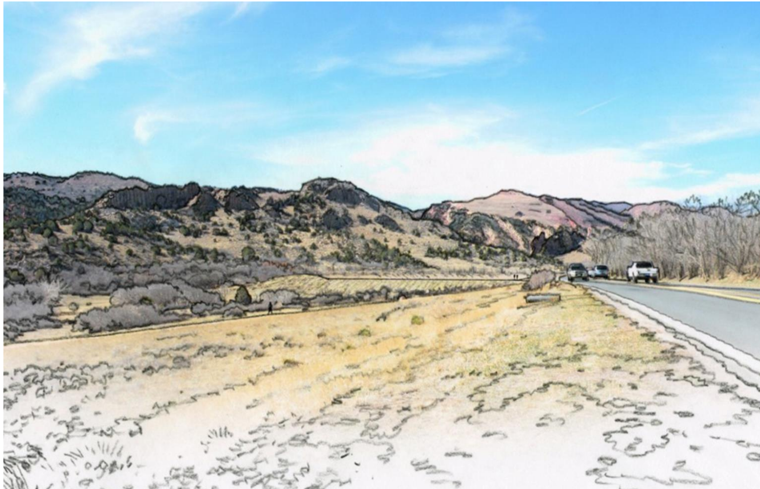
North View After