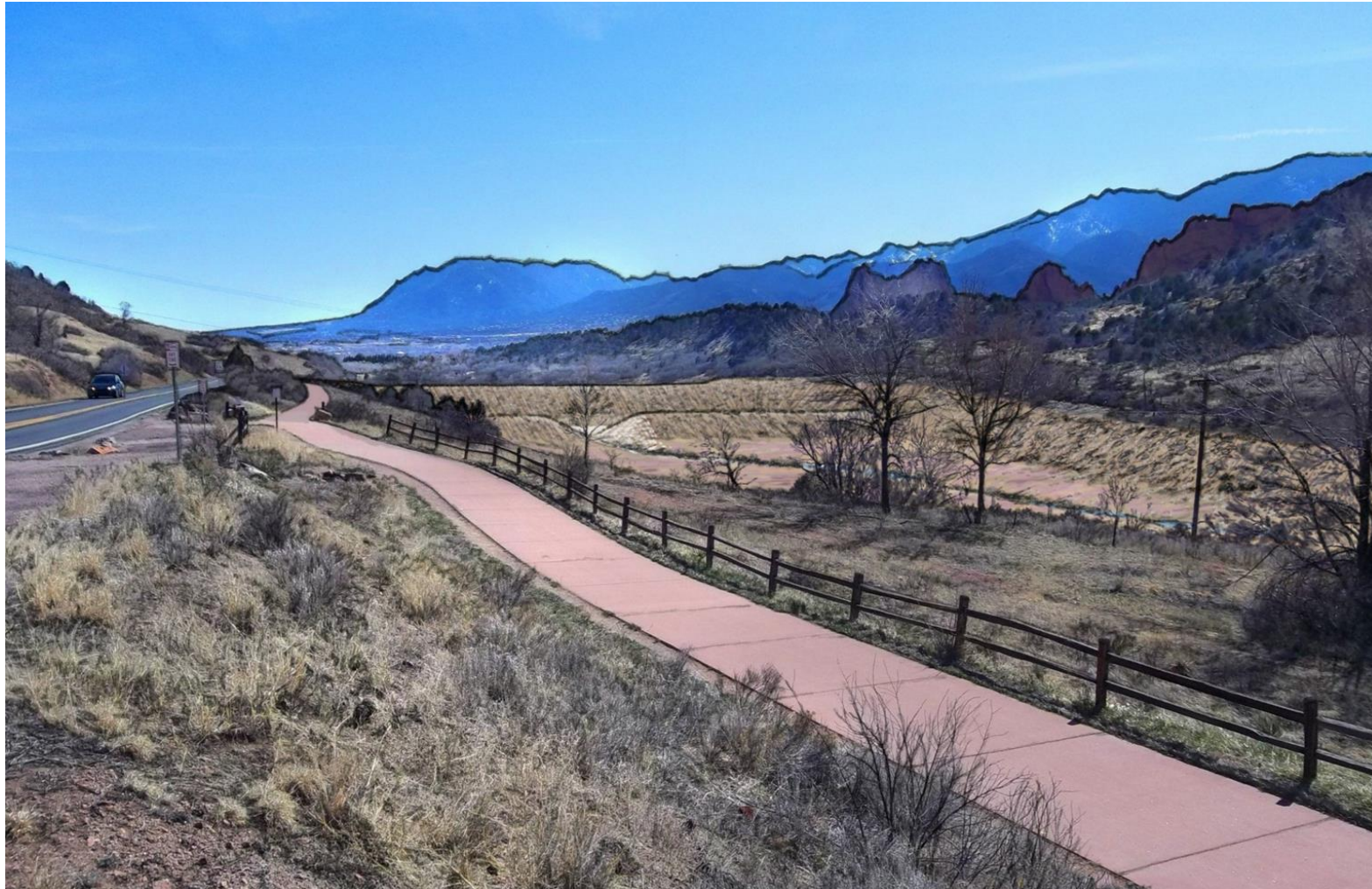
South View After