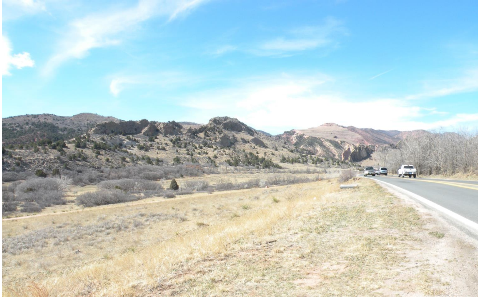
North View Before