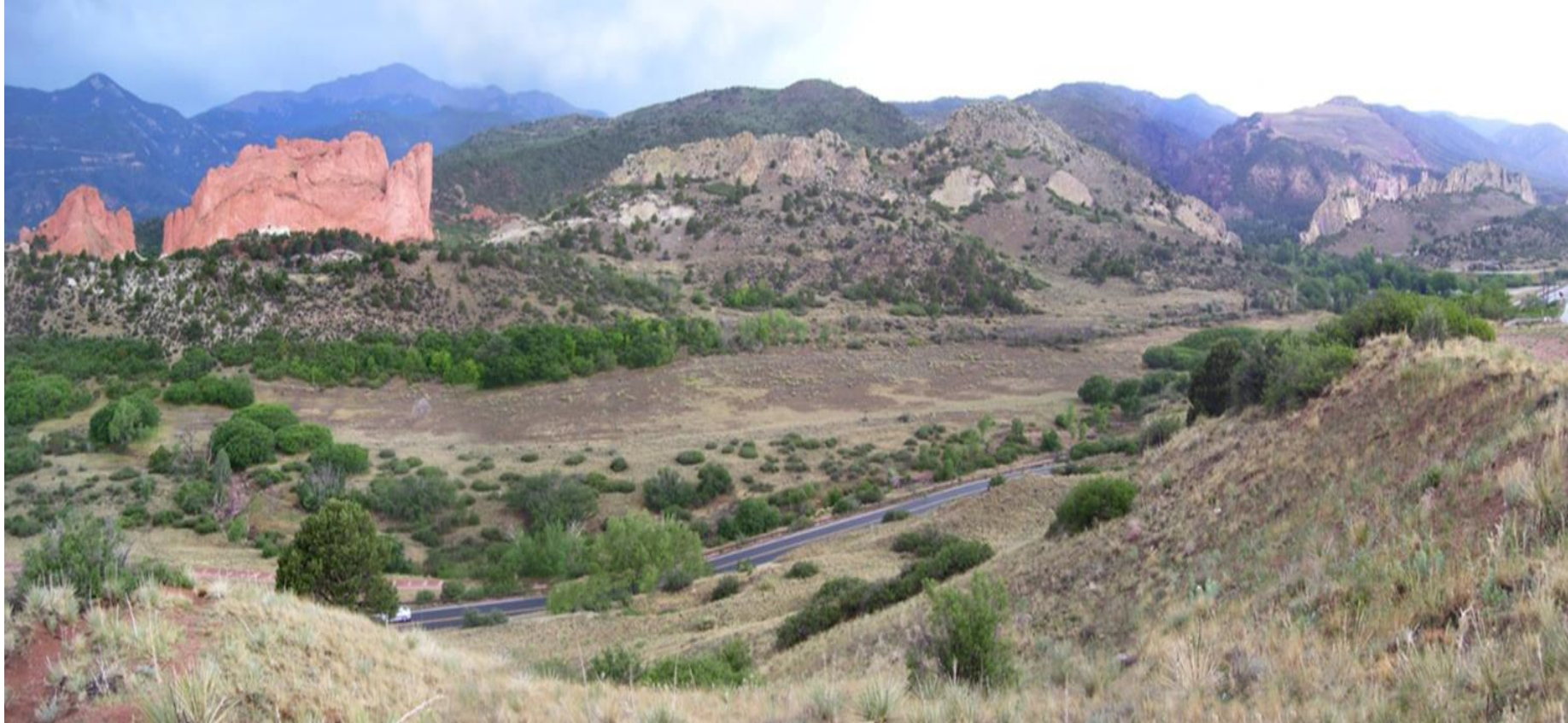
East View Before