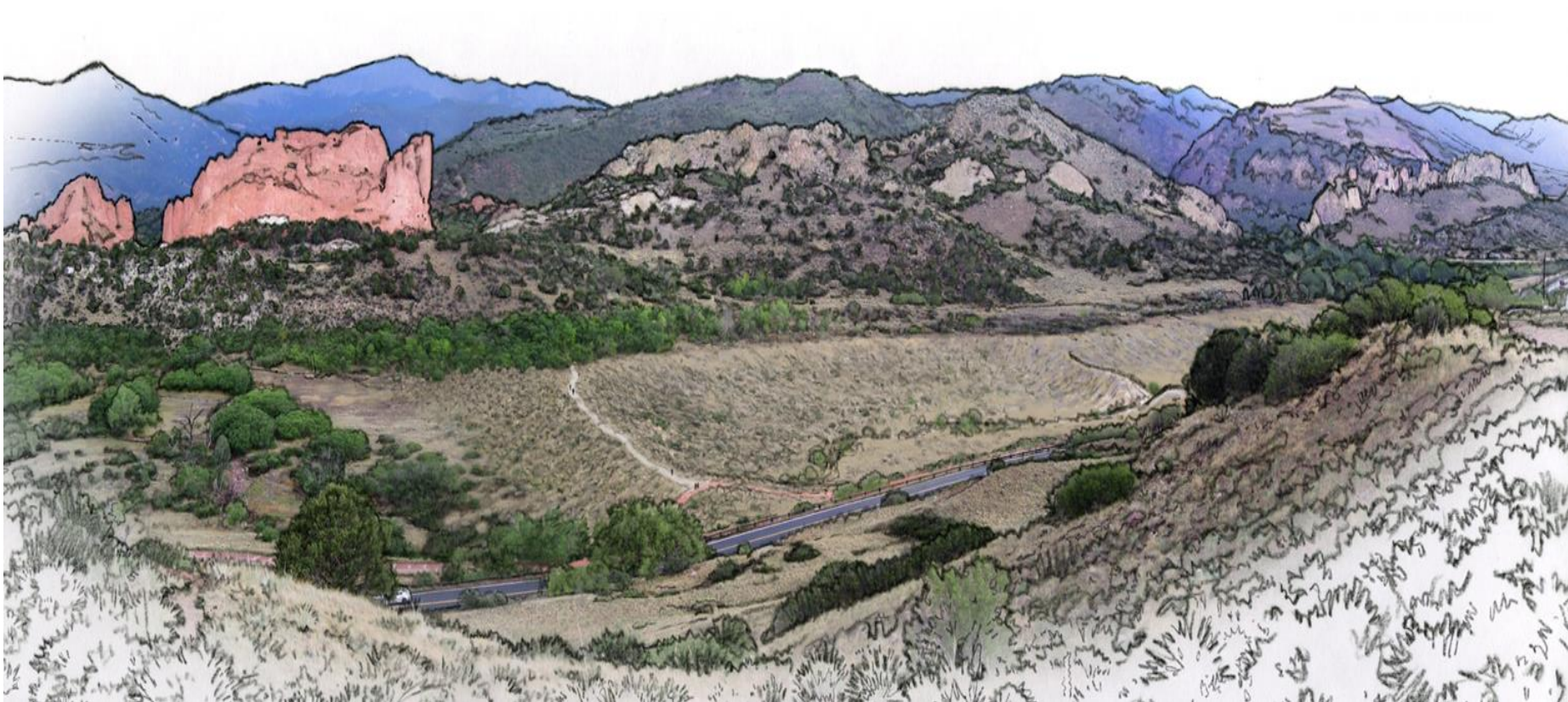
East View After