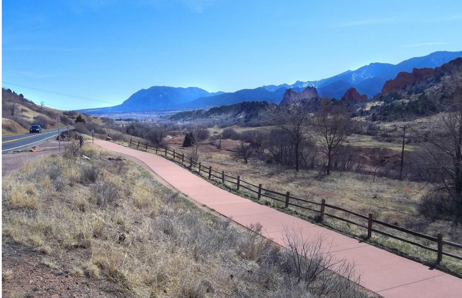
South View Before