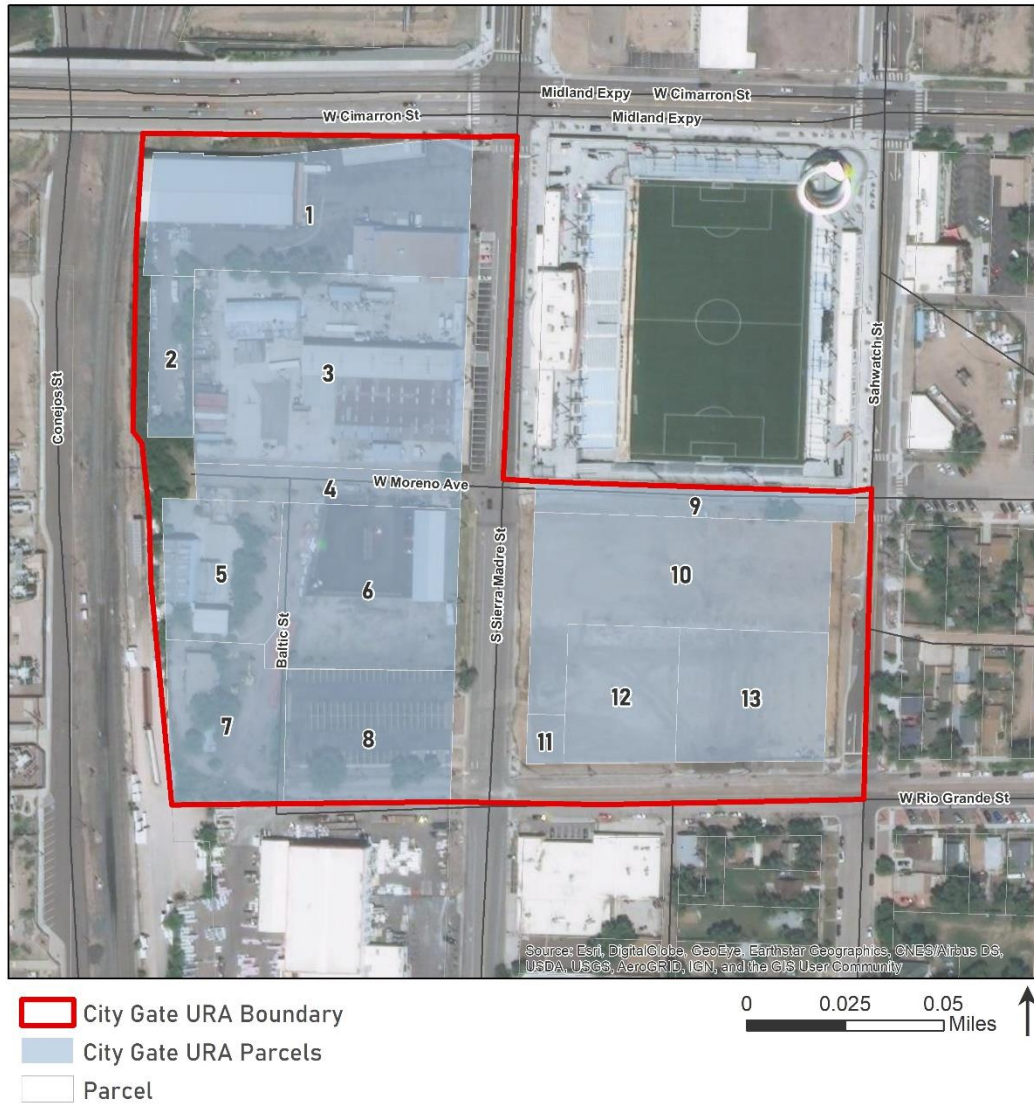
Figure 1. City Gate Urban Renewal Plan Area