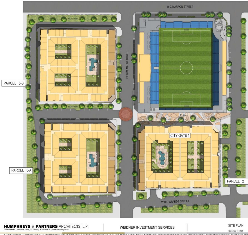
Figure 3. City Gate Phase 1 Rendering