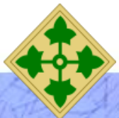
4 th ID FCCO