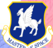
50 th Space Wing SAFB