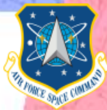
Space Command PAFB