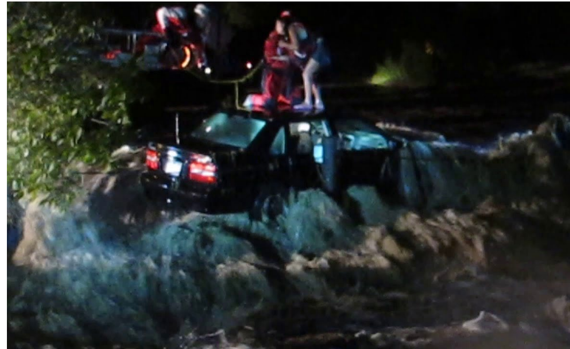
Emergency rescue during flood event at Sifred/Date