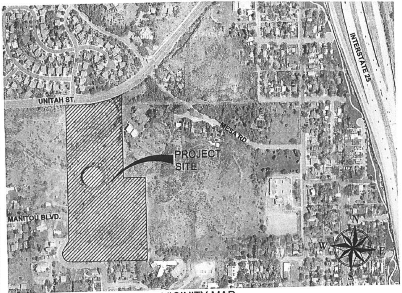
VICINITY MAP N.T.S.