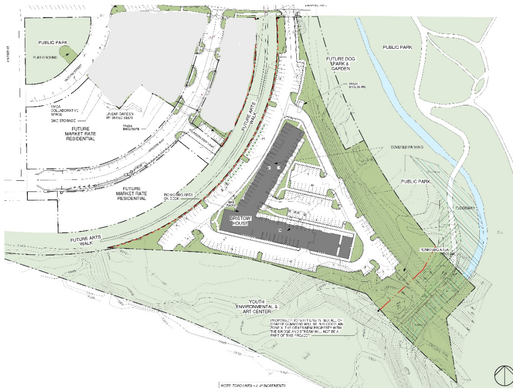
Figure 2. Bristow House Site Plan

Bristow House will be a workforce housing development located on the southern parcels 4 to 6. The proposed site plan, illustrated in Figure 2 , includes approximately 185 units ranging from studio, one-, and two-bedroom units. The rental rates for all units will range from 70 percent to 110 percent of area median income (AMI).