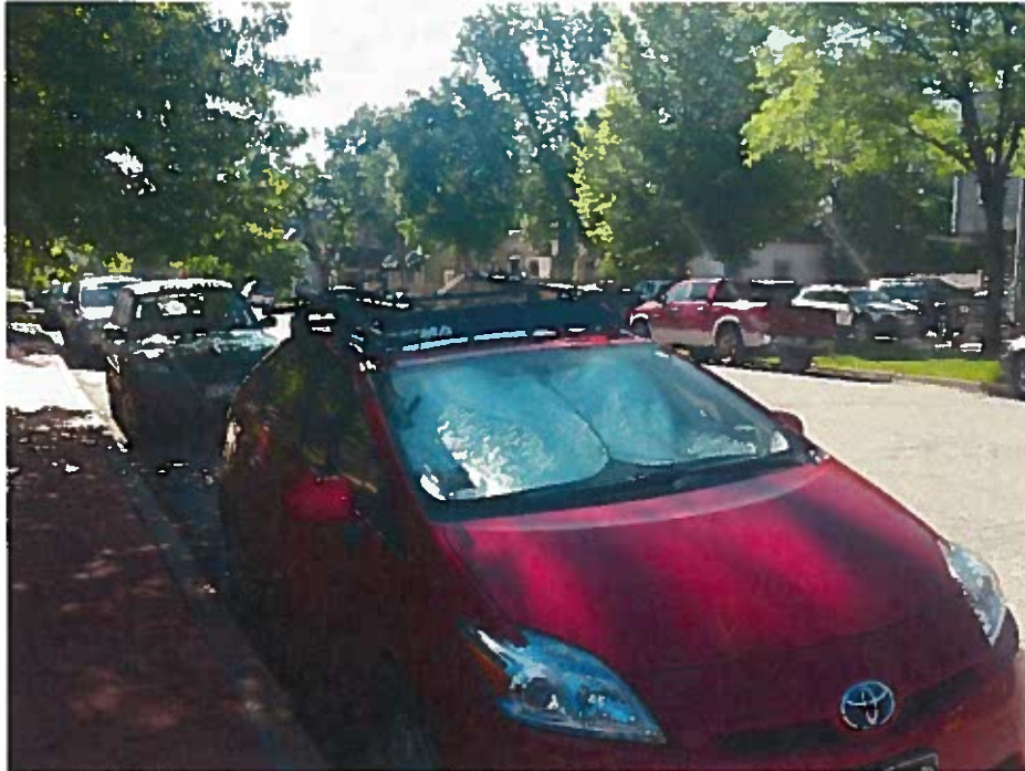
6/12/17 9:00AM NE Corner of Dale and Weber