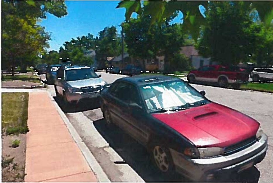
6/13/17 1:00PM NE Corner of Dale and Weber