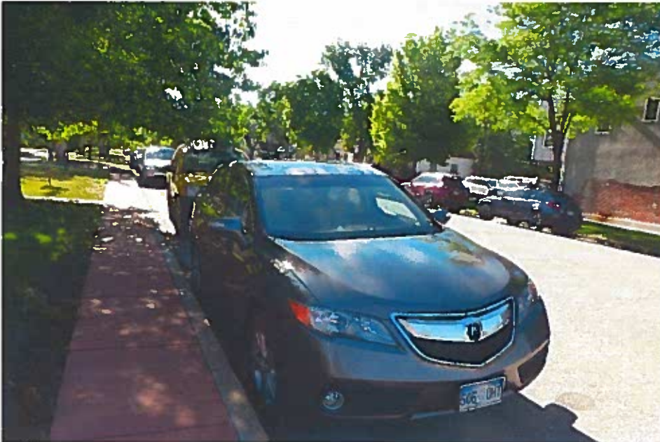
6/13/17 9:00AM NE Corner of Dale and Weber