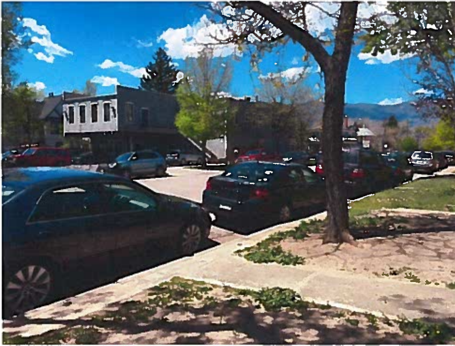
5/16/17 12:40PM from 315 E Dale St