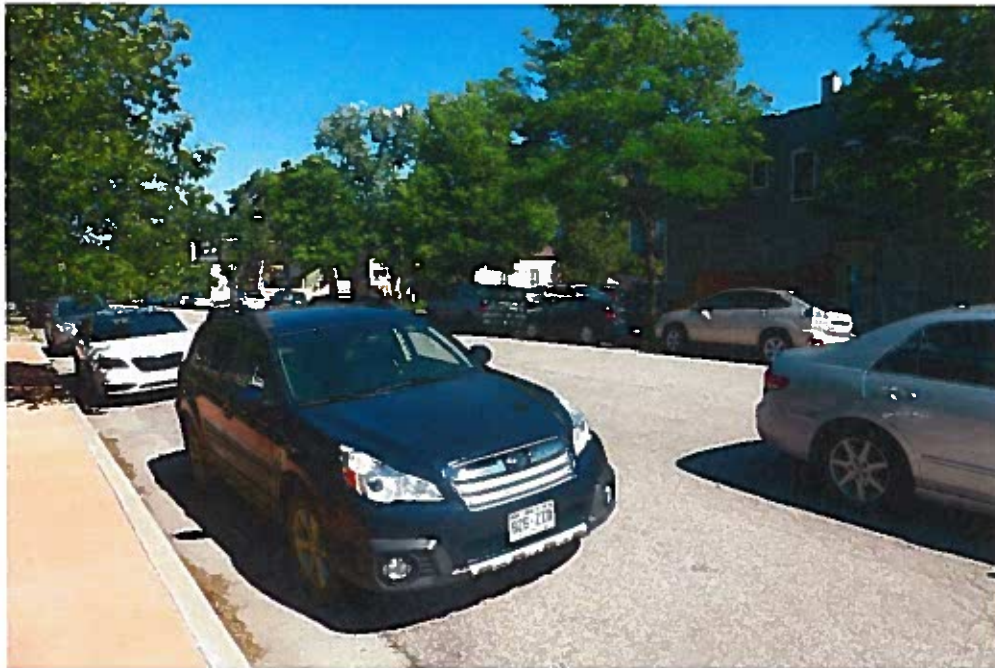
6/13/17 4:00PM NE Corner of Dale and Weber