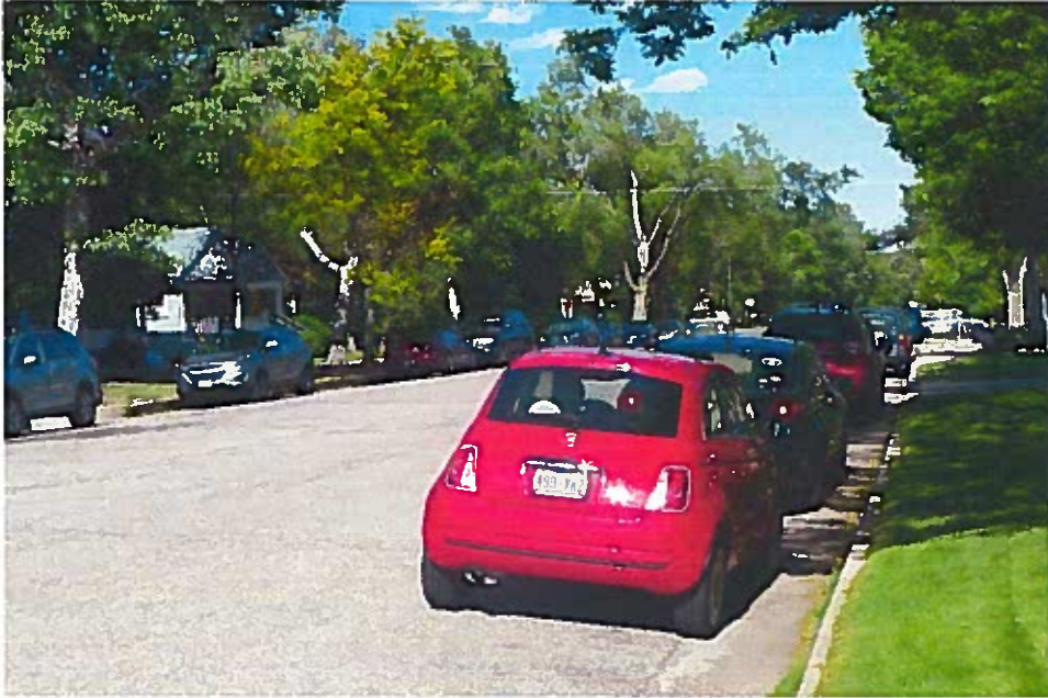
6/13/17 5:00PM SE Corner of Dale and Weber