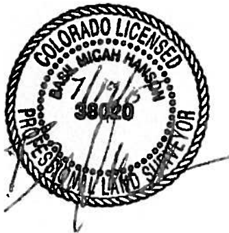
EXHIBIT B SKETCH is attached hereto and is only intended to depict Exhibit A – Legal Description. In the event that Exhibit A contains an ambiguity, Exhibit B may be used to solve said ambiguity.