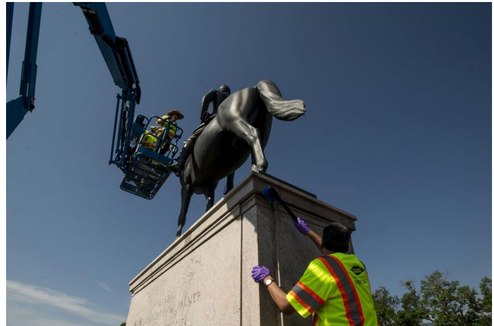
W.J. Palmer sculpture, donated 1929 Cleaned for the sesquicentennial, 2021