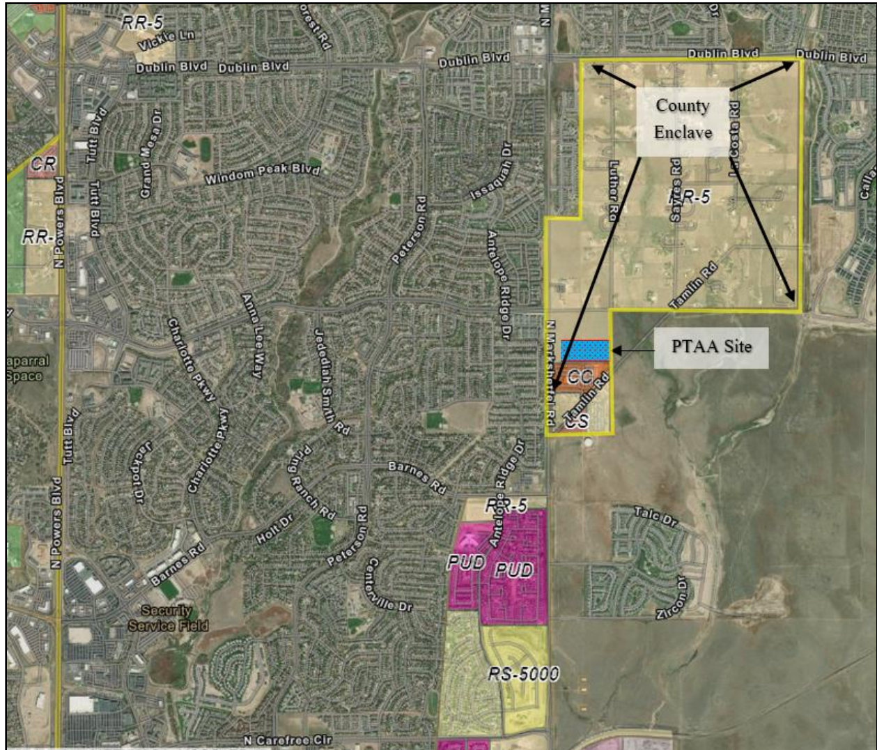
Exhibit 2. Map of the PTAA site (Project Site) and overall El Paso County Enclave

Proposed access into the site is via an access easement to the north connecting to the future extension of Stetson Hills and proposed access leaving the site is via a right-out only access on Marksheffel Road at the southwest corner of the site.