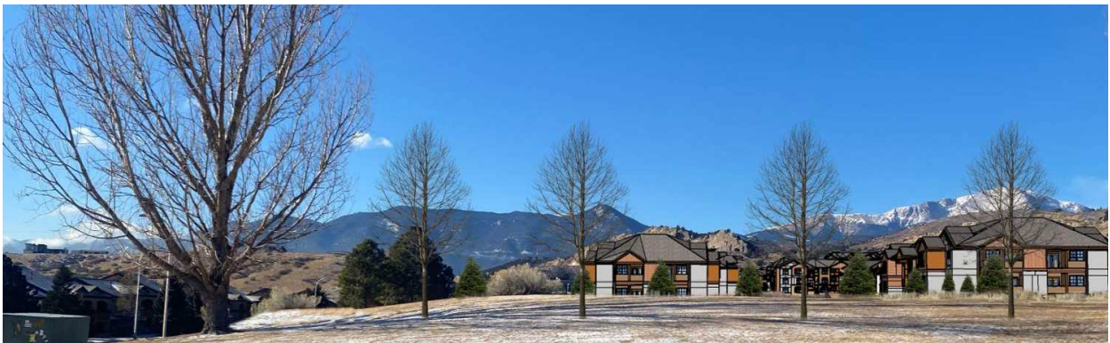
3.2 PHASE 2 CONCEPT B

(REVISED CONCEPT FOR 220 UNITS IN PHASE 2; 420 TOTAL UNITS)