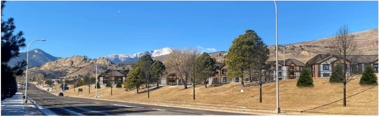
2.1 PHASE 2 CONCEPT A

(ORIGINAL CONCEPT FOR 240 UNITS IN PHASE 2; 450 TOTAL UNITS)