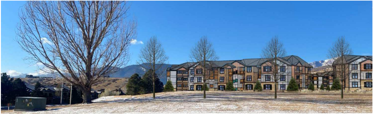
3.1 PHASE 2 CONCEPT A

(ORIGINAL CONCEPT FOR 240 UNITS IN PHASE 2; 450 TOTAL UNITS)