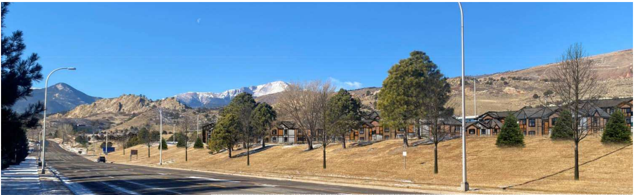
2.2 PHASE 2 CONCEPT B

(REVISED CONCEPT FOR 220 UNITS IN PHASE 2; 420 TOTAL UNITS)