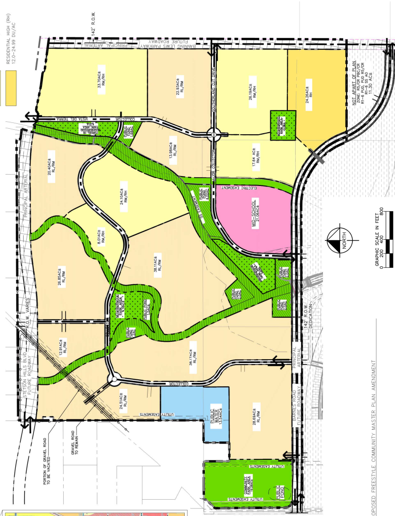
(B) PROPOSED FREESTYLE COMMUNITY MASTER PLAN AMENDMENT