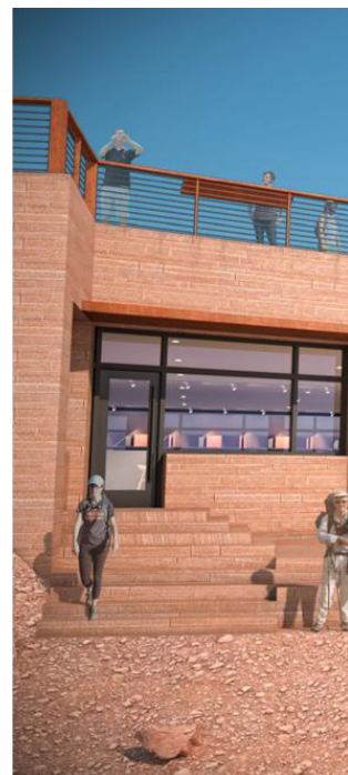
Rendering of Summit House

Also set to draw tourists is the new Pikes Peak Summit House that broke ground in June and is set to be completed in late 2020. Since Pikes Peak—America's Mountain is a City enterprise, City Council has to agree to appropriate funds for the project (which they did in April, appropriating $13.5 million) and Council agreed in September to a better interest rate on bonds that would raise up to $33 million for the estimated $55 million, 38,000 square-foot structure.