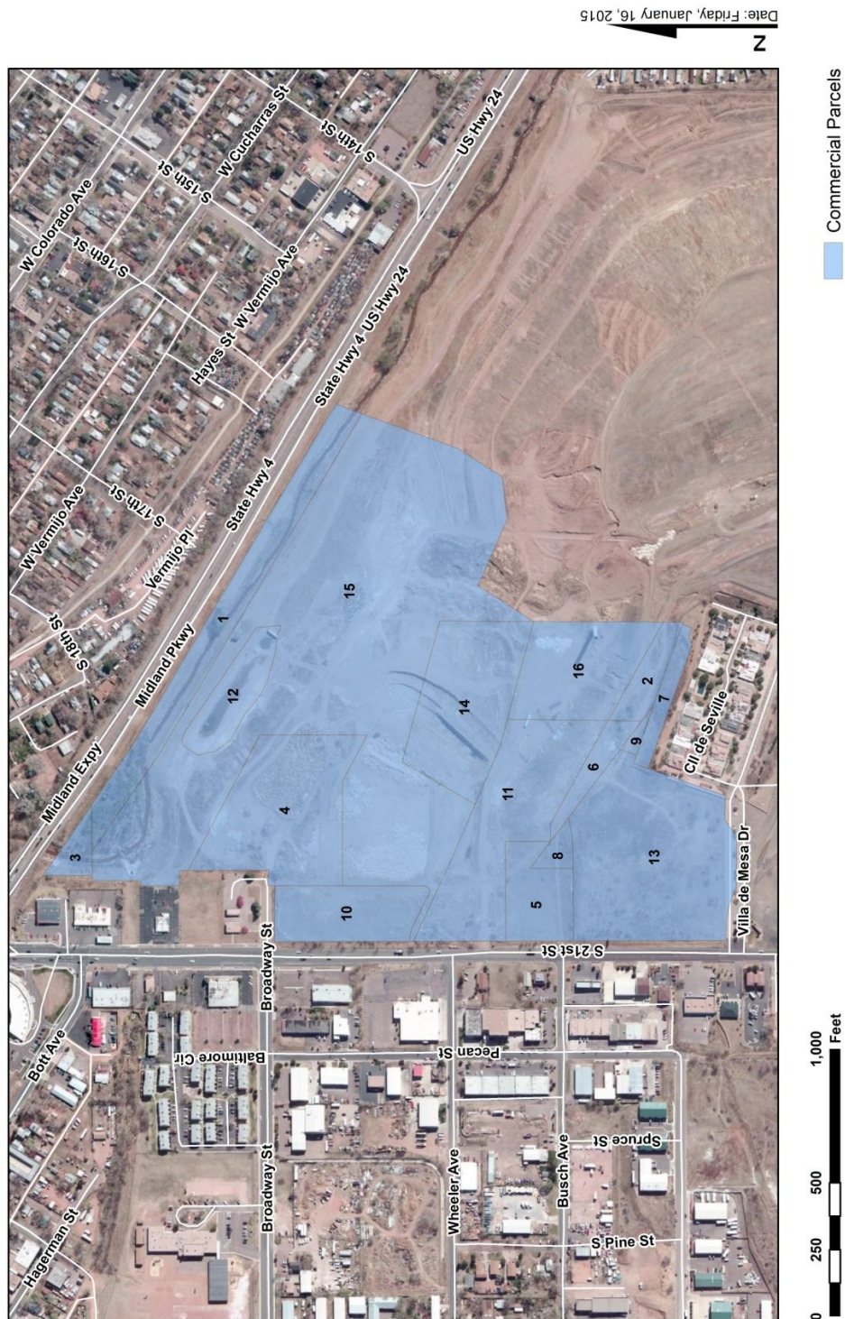
Figure No. 1: Gold Hill Mesa Commercial Urban Renewal Project Boundary Map