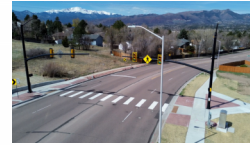
Northern Crossing: Dublin Park