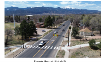
Shooks Run at Uintah St.