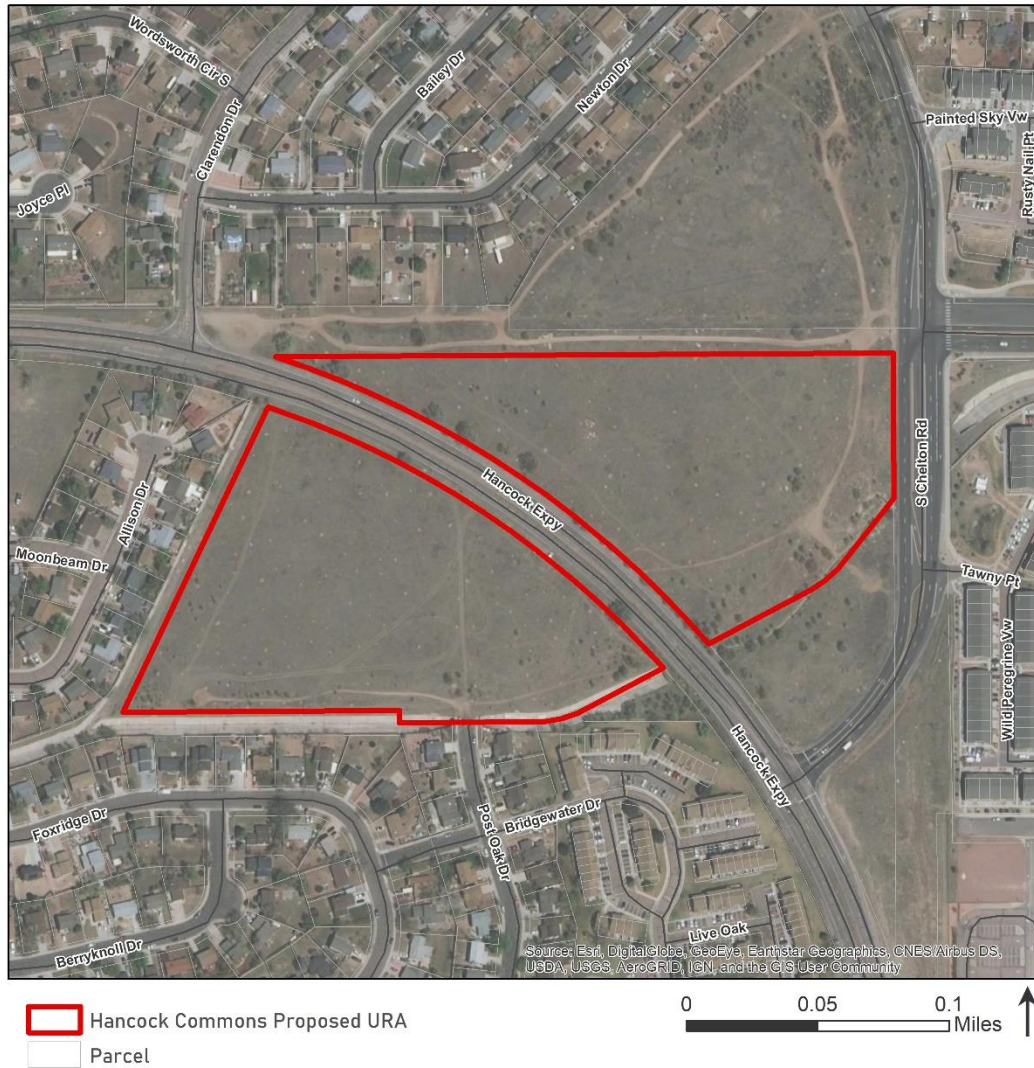
Figure 1. Hancock Commons Urban Renewal Plan Area