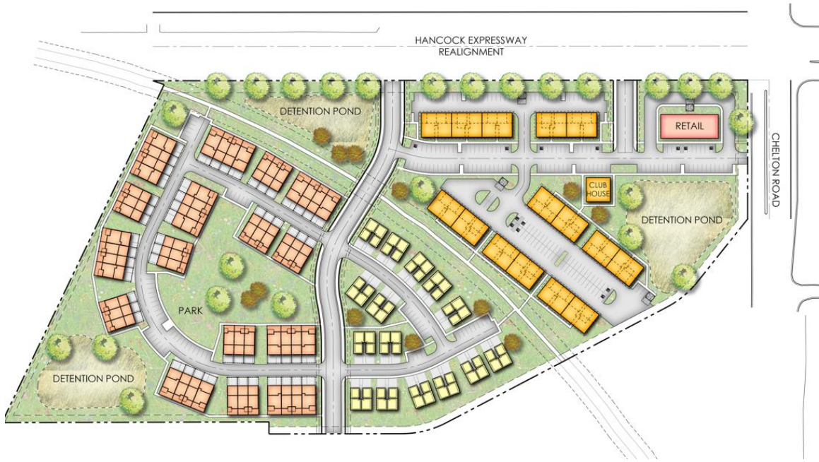
Figure 2. Hancock Commons Site Plan